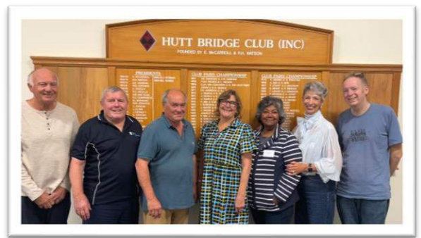
Most of the 2026 Committee – see below for the line-up